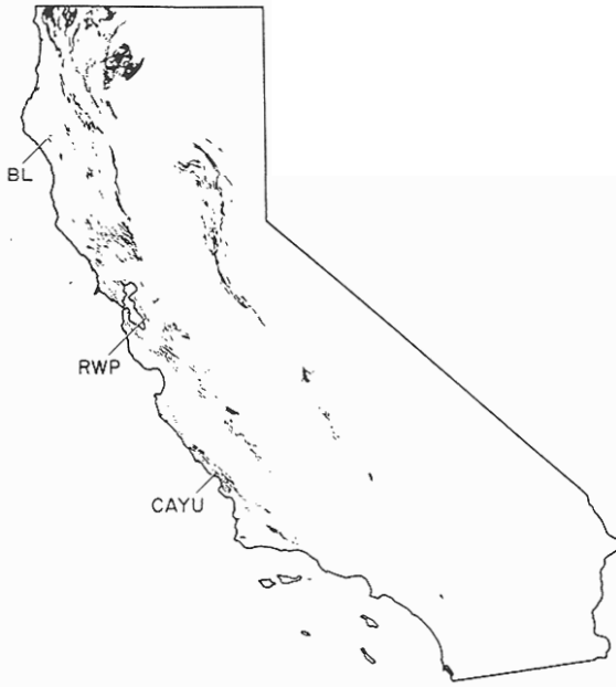
Fig. 1. Geographic distribution of serpentine outcrops in California [1]. Field study sites are indicated for Blue Lake (BL), Redwood Park (RWP), and Cayucos (CAYU).